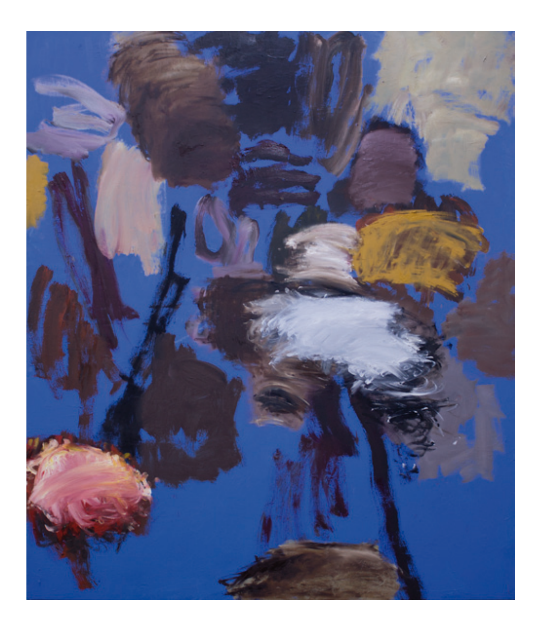
Mario Weinberg / Maybe later acrylic paint on canvas 140 x 160cm / Shanghai, 2014