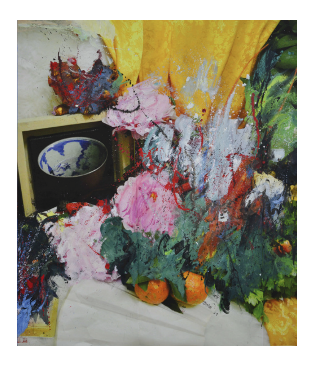
Wang Yuhong / 雨后 mixed media on paper 140 x 160cm / Shanghai, 2014